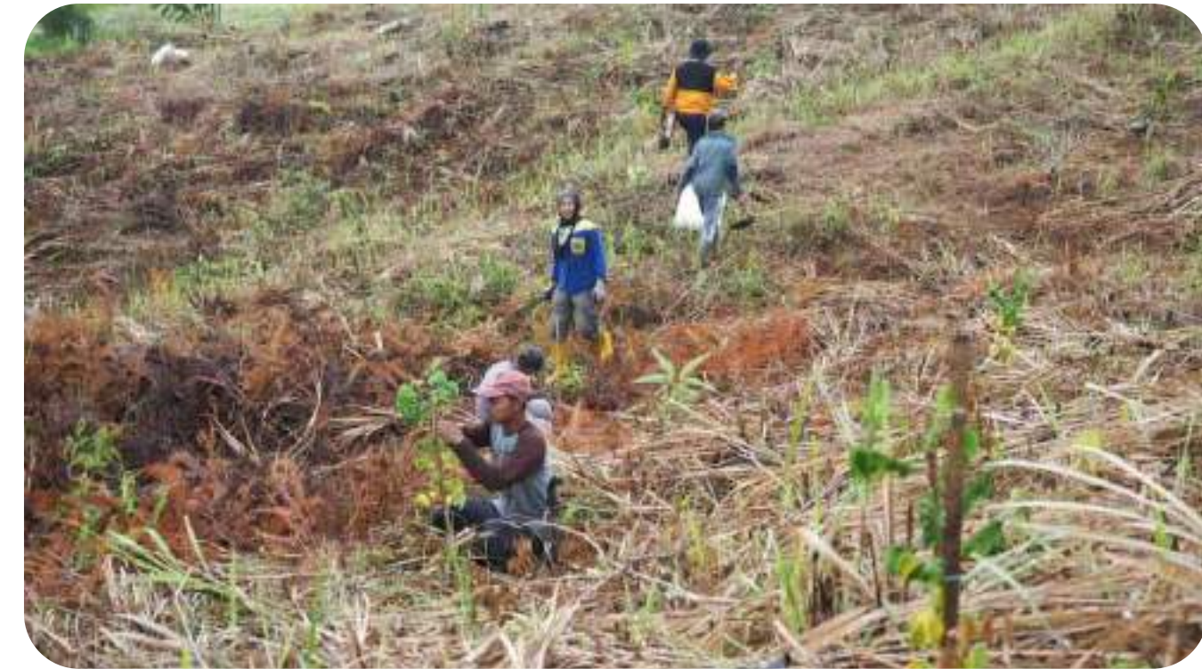
Tree Planting Activities in the Cikanyere Conservation Forest, in collaboration with the INARA Foundation

In order to carry out social responsibility and participate actively in developing the business community in Indonesia, PT LAPI ITB carries out community empowerment programs, to help improve the level of community welfare through environmentally friendly economic activities. In carrying out these activities, PT LAPI ITB collaborates with the ITB Student Activity Unit and other institutions engaged in the social, educational and environmental fields.