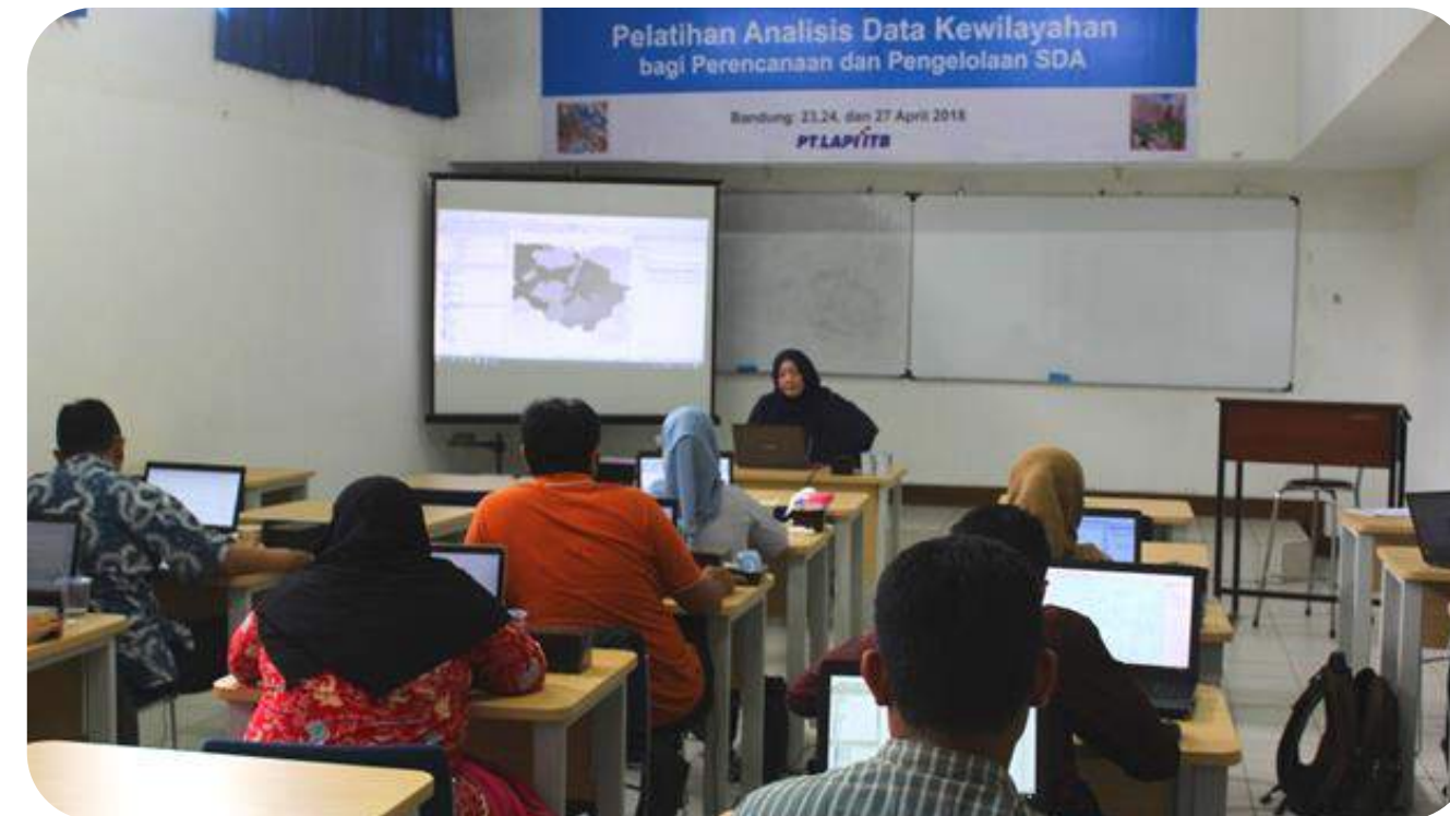
Training on Territorial Data Analysis for Water Resources Planning and Management