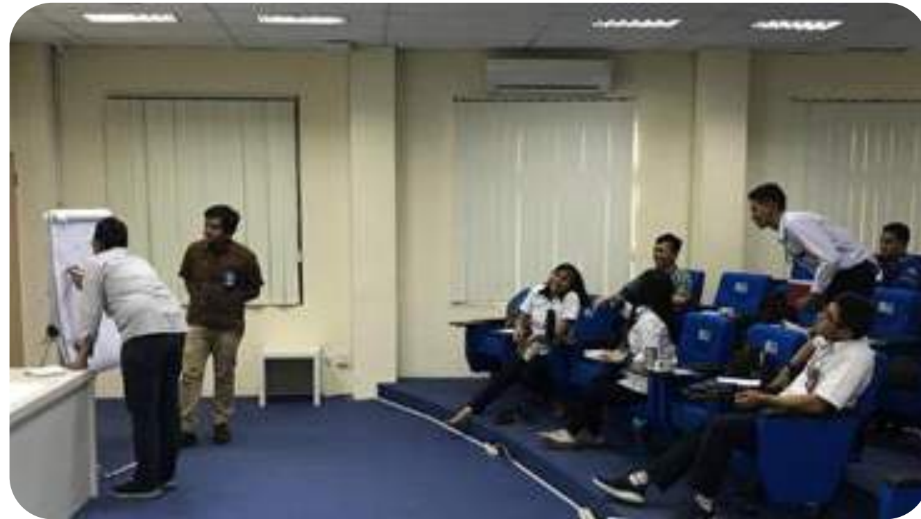
Workshop Life Cycle Assessment, PT Pembangunan Jawa Bali