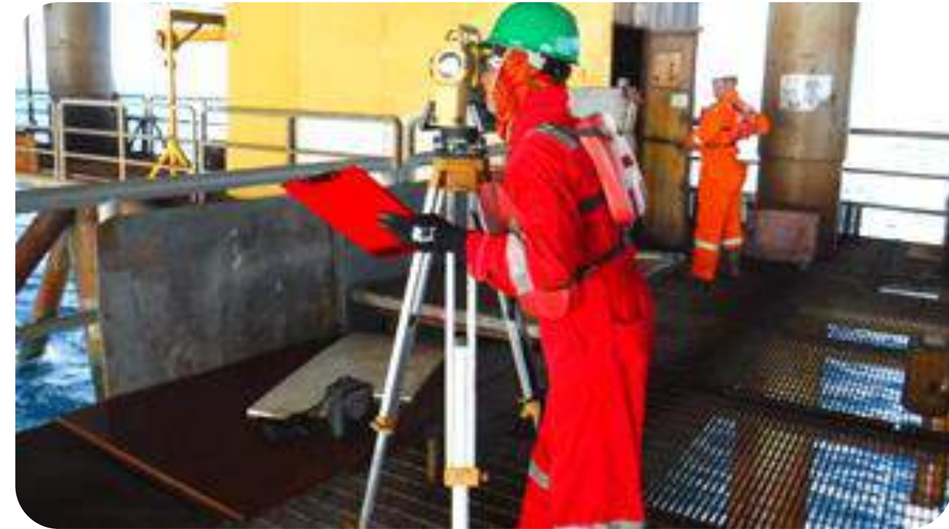
Engineering Services at Offshore Facilities