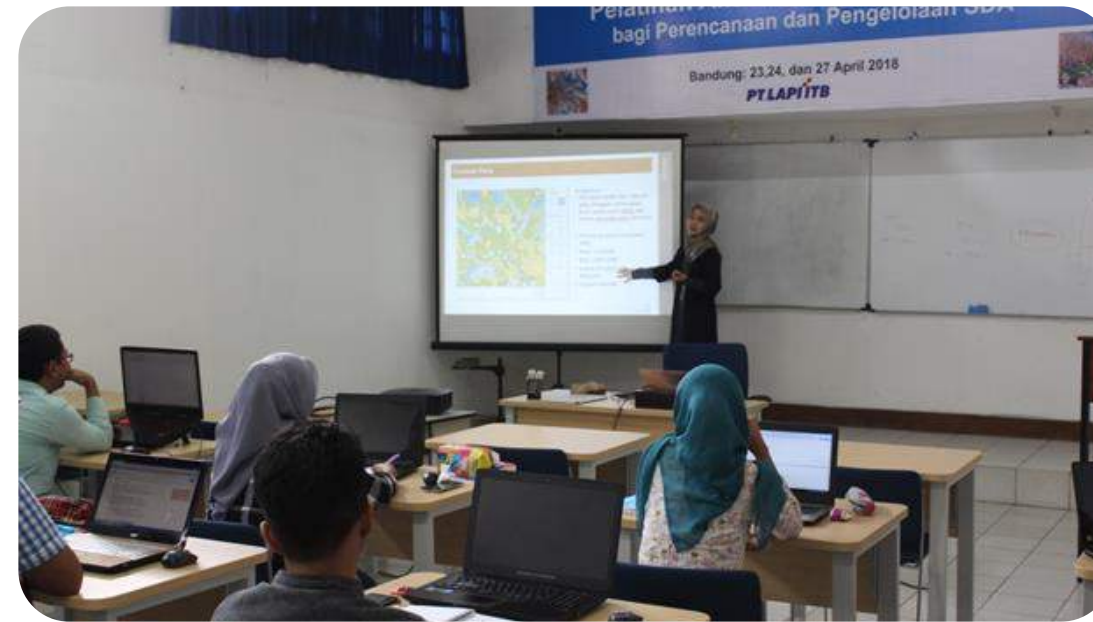
Training on Territorial Data Analysis for Water Resources Planning and Management