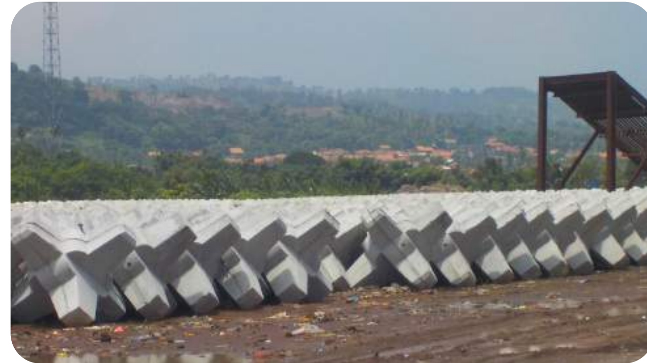
Breakwater Implementation “A-JACK” in Harbor.