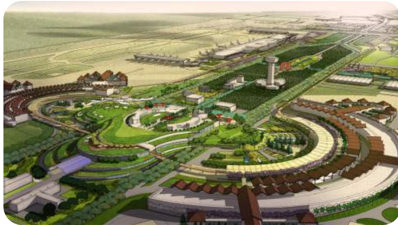
Basic Design of Soekarno-Hatta Airport