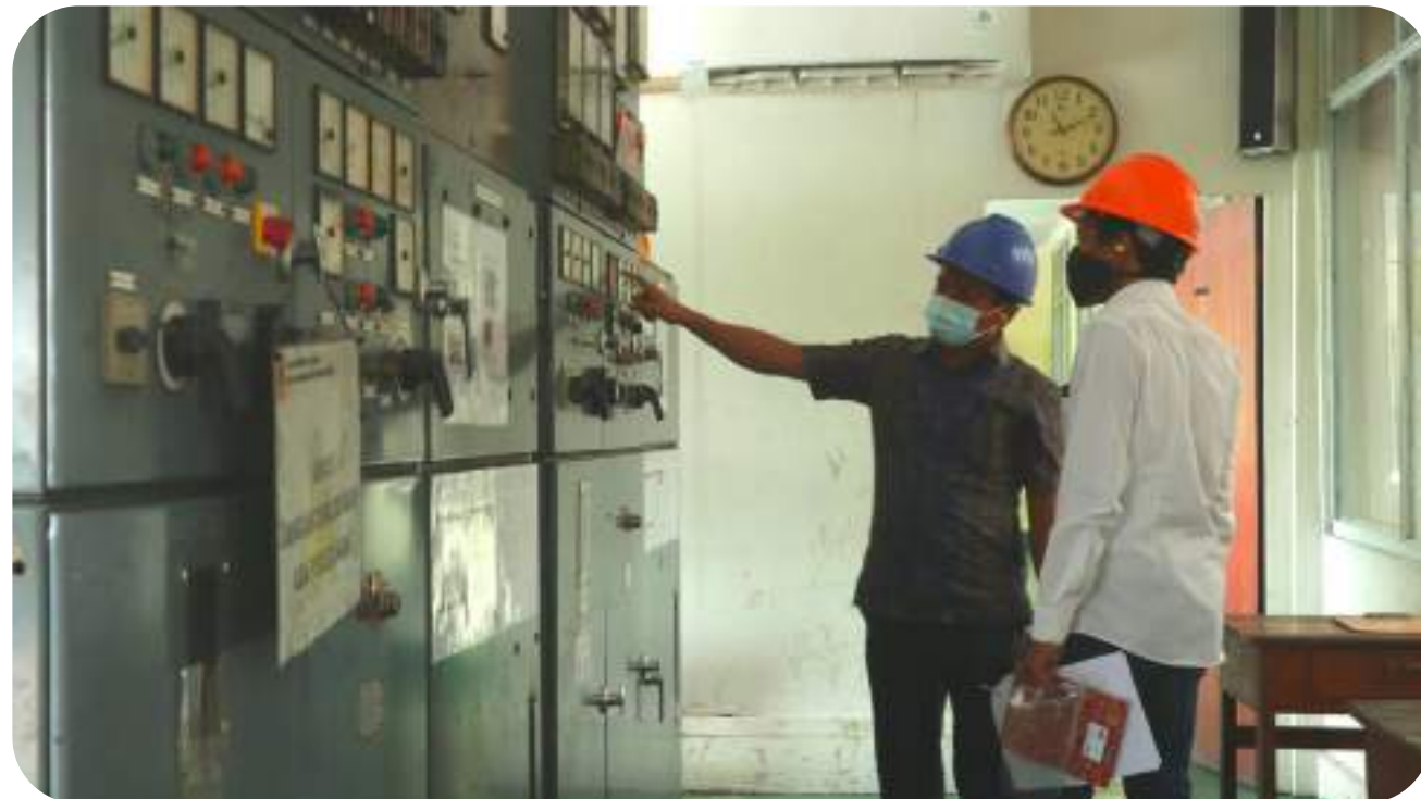
Generation SFC Study