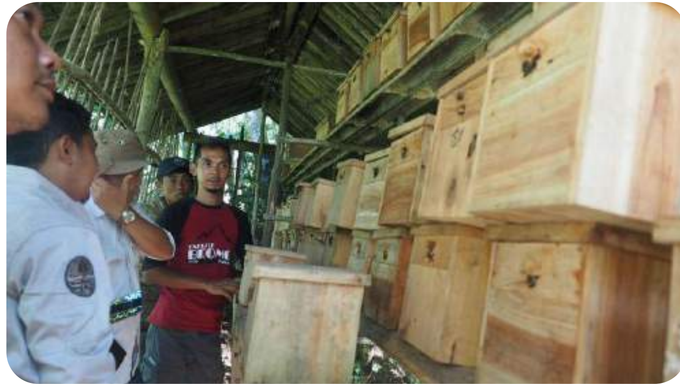
Bunikasih Village Community Empowerment Activities, in collaboration with the INARA Foundation, IA ITB and KMPA Ganesha ITB