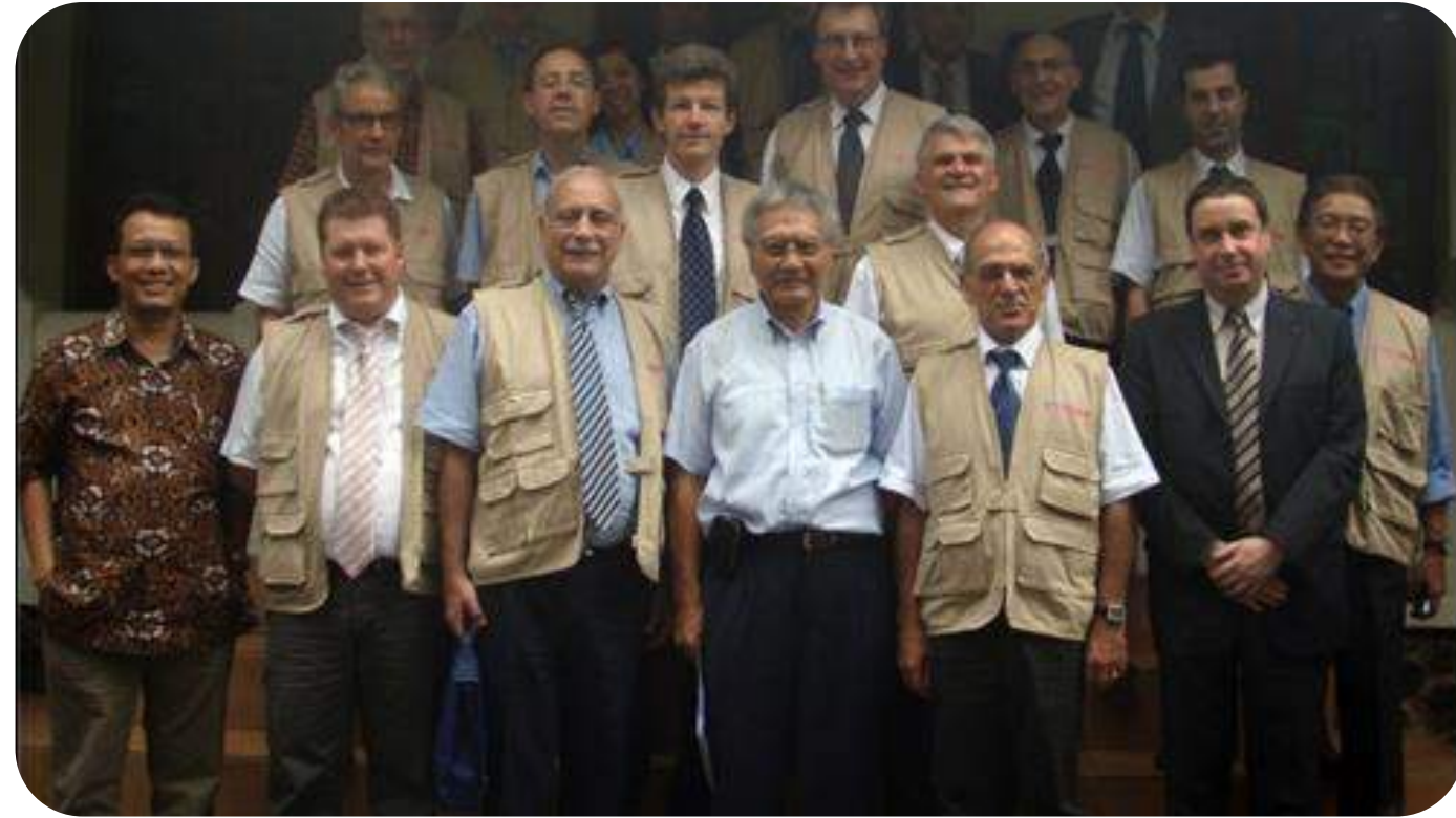
Cooperation with SNCF-France for Mass Rapid Transport Research