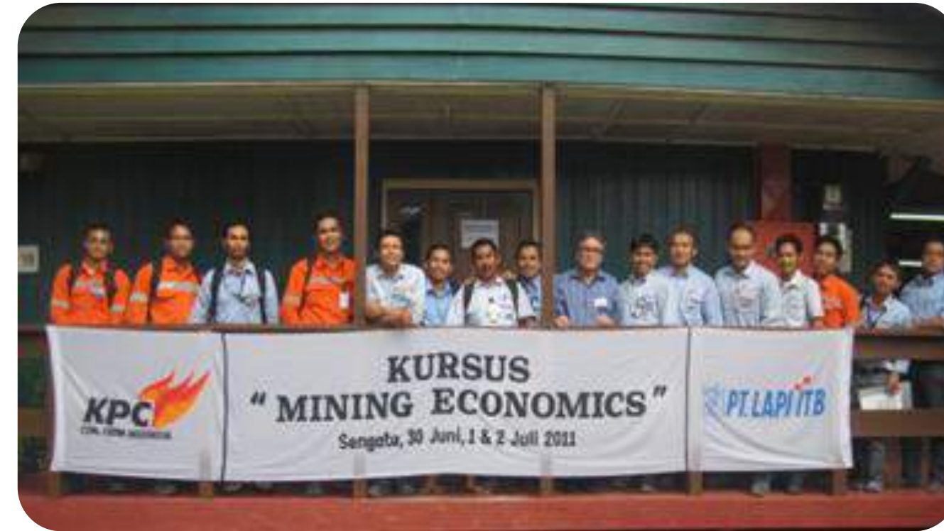
Mining Economic Training, KPC