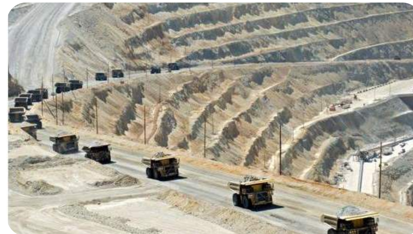
The Application of Collision Avoidance System (CAS) in Mining