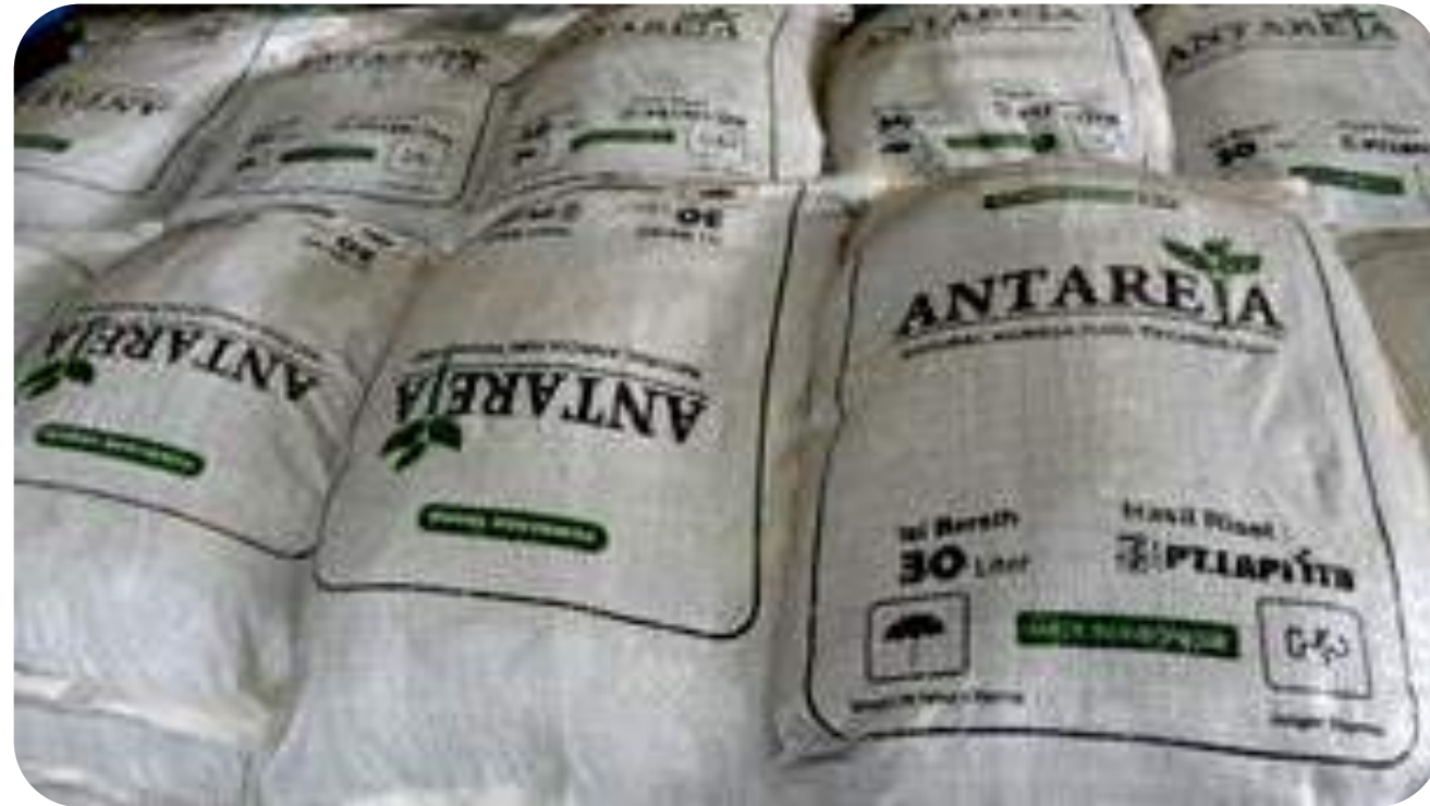
“ANTAREJA” Soil Improving Microbes