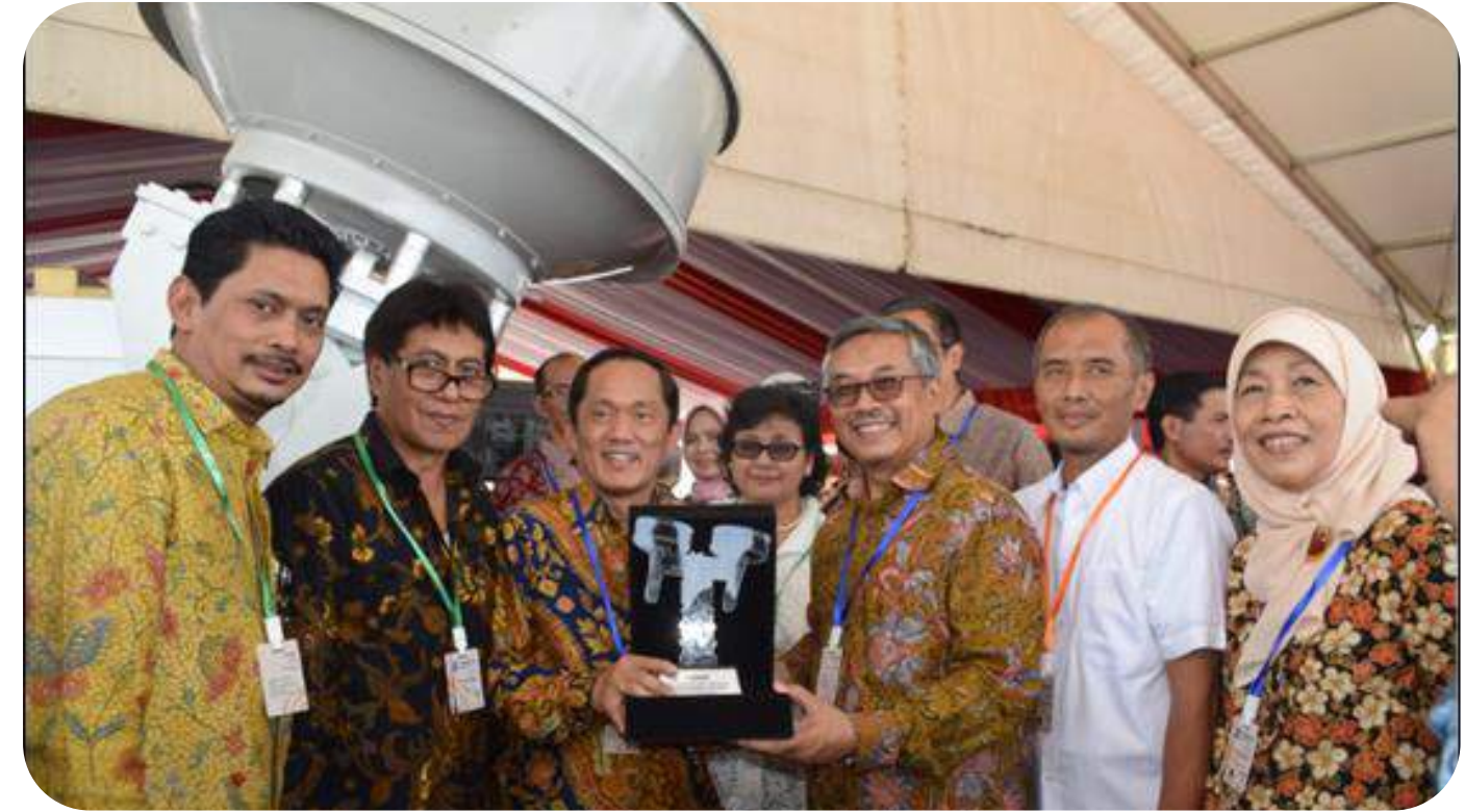
Cooperation with National BUMN (State-owned Corporation) for Weather Radar Development

PT LAPI ITB has collaborated with various institutions and companies, which include: