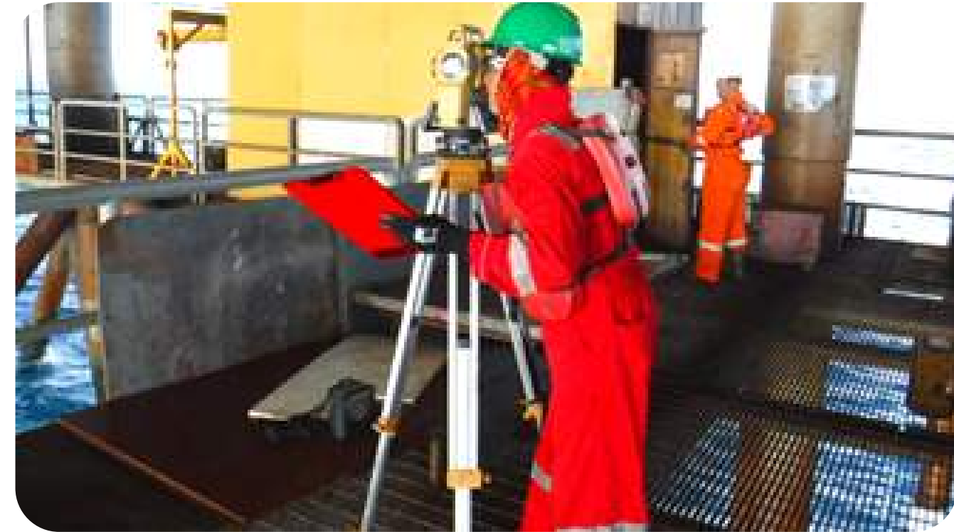
Engineering Services at Offshore Facilities