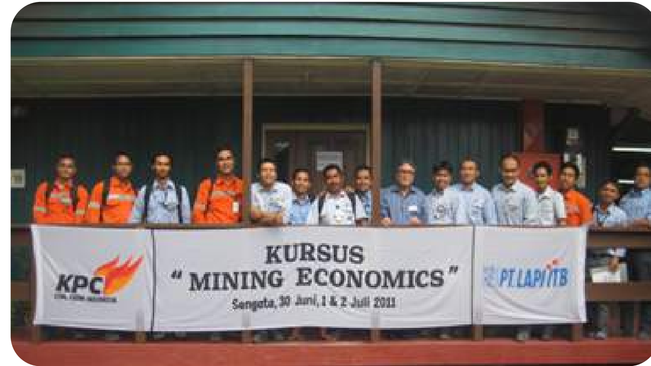
Mining Economic Training, KPC