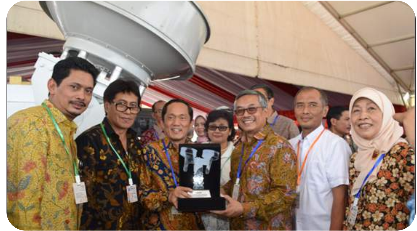
Cooperation with National BUMN (State-owned Corporation) for Weather Radar Development

PT LAPI ITB has collaborated with various institutions and companies, which include: