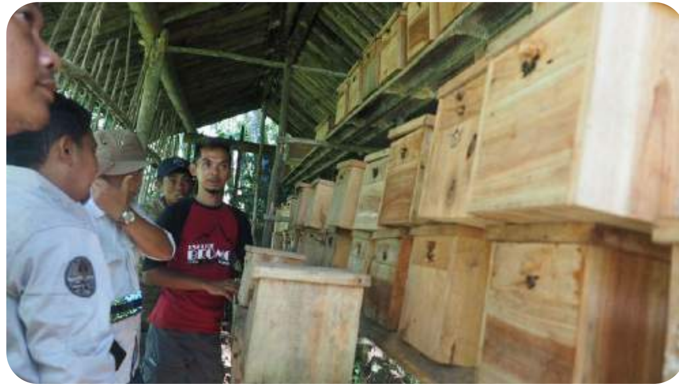
Bunikasih Village Community Empowerment Activities, in collaboration with the INARA Foundation, IA ITB and KMPA Ganesha ITB