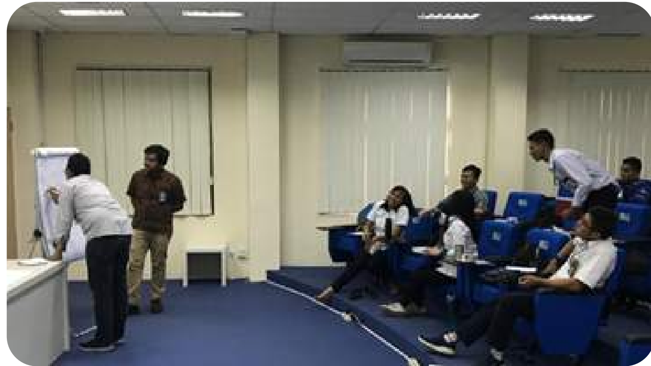
Workshop Life Cycle Assessment, PT Pembangunan Jawa Bali