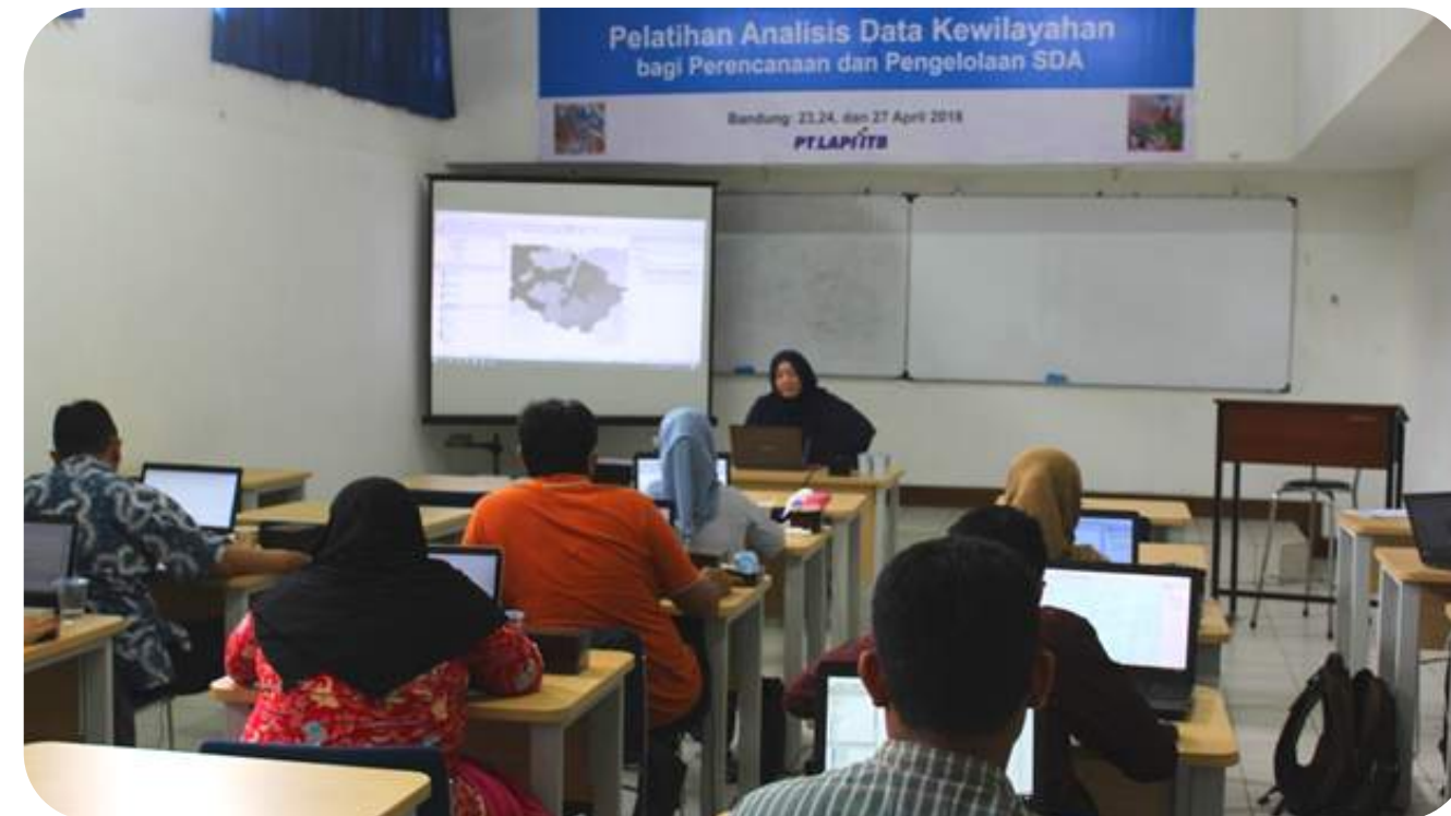
Training on Territorial Data Analysis for Water Resources Planning and Management