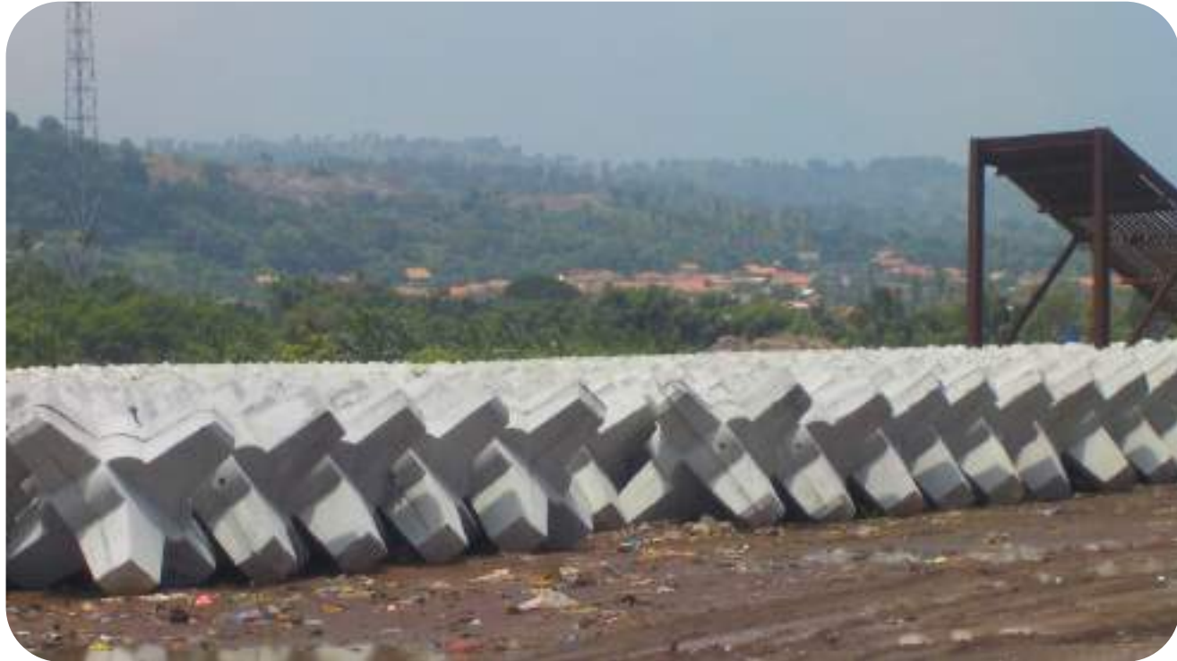
Breakwater Implementation “A-JACK” in Harbor.